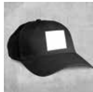
approx. 6 x 6 cm