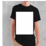
approx. 57 x 50 cm