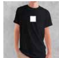
approx. 10 x 10 cm