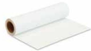
approx. 57 x 100 cm